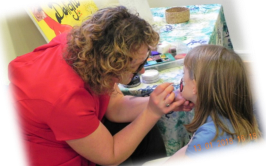
Face painting enjoyed by both adults and children!

In an attempt to offer more local help for families we are running two family friendly events each year—a New Year party and a late summer barbecue.. Why not bring the family along in January? If there are non-coeliac children in your family they would be most welcome too.