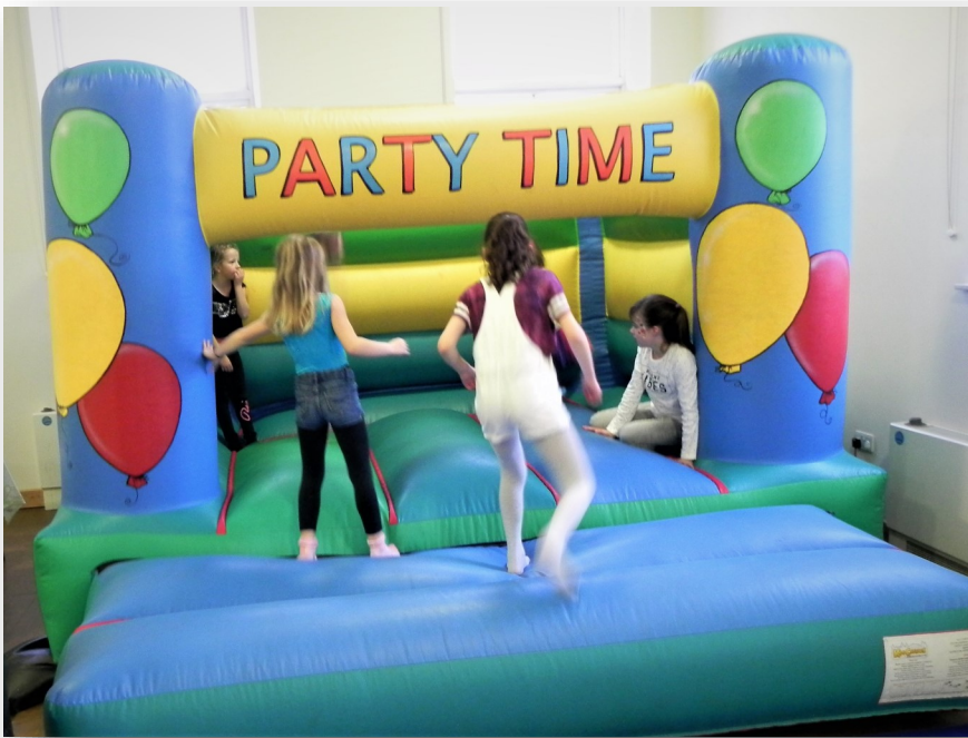
Fun at the 2018 New Year family party